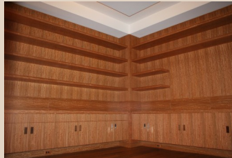
Exotic Wood Species